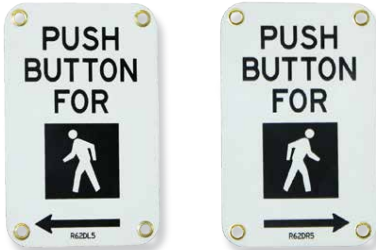
Front and back of a 5" x 7" double-sided sign shown, showcasing left and right arrows.

5" x 7" 9" x 12" Single sided Double sided