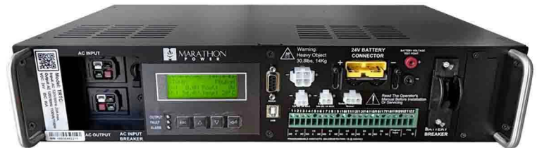
TRTC-0654-N1 & TRTC-1124-N1