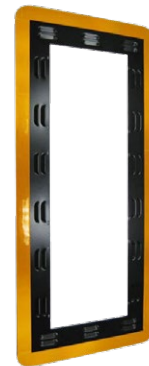
3-Section louvered backplate

The McCain Backplate with Reflective Borders provides visual contrast between signal heads and enhance signal visibility for the driver. The reflective borders, through the use of retroreflective tape, provide an aesthetically pleasing and functional look while increasing traffic safety at intersections. The Federal Highway Administration approved the use of retroreflective tape after a seven-year safety study showed that the use of retroreflective backplate borders reduced total crashes at intersections by 15% to 24%.