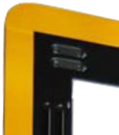
Reflective tape, with louvers