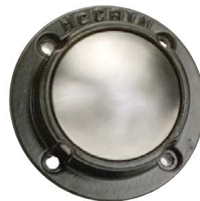
2" ADA pushbutton

To learn more about McCain's Integrated Traffic Solutions, please contact info@mccain-inc.com or call (760) 727-8100