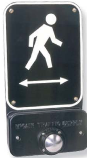
9" x 12" Pushbutton (plate sold separately)

Cabinets Controllers Signals Signs Software Specialty