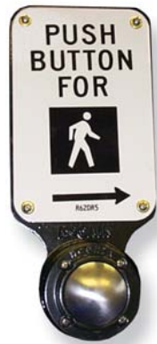
5" x 7" Pushbutton (plate sold separately)